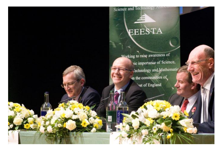
Above: Amused speakers during the Question and Answer session

The seminar ended with a chaired question and answer session which provided further interesting insights from all the speakers. The Chairman then summed up, mentioning the topic for the 2012 Seminar, "The Herschel Space Observatory".