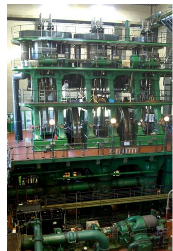
Kempton's 1000 ton triple expansion steam pumping engine

We will travel to the Kempton Steam Museum by car. Please let me know how you are coming to our house, so that I can be sure that there will be enough spare seats in cars to take members who are coming public by transport to the museum, and later to a public transport point. (If not, I will make other arrangements.)