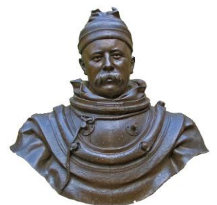
Right: William Walker.