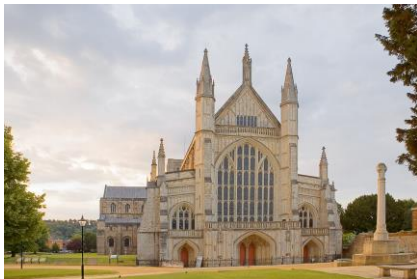
Left :Winchester Cathedral.