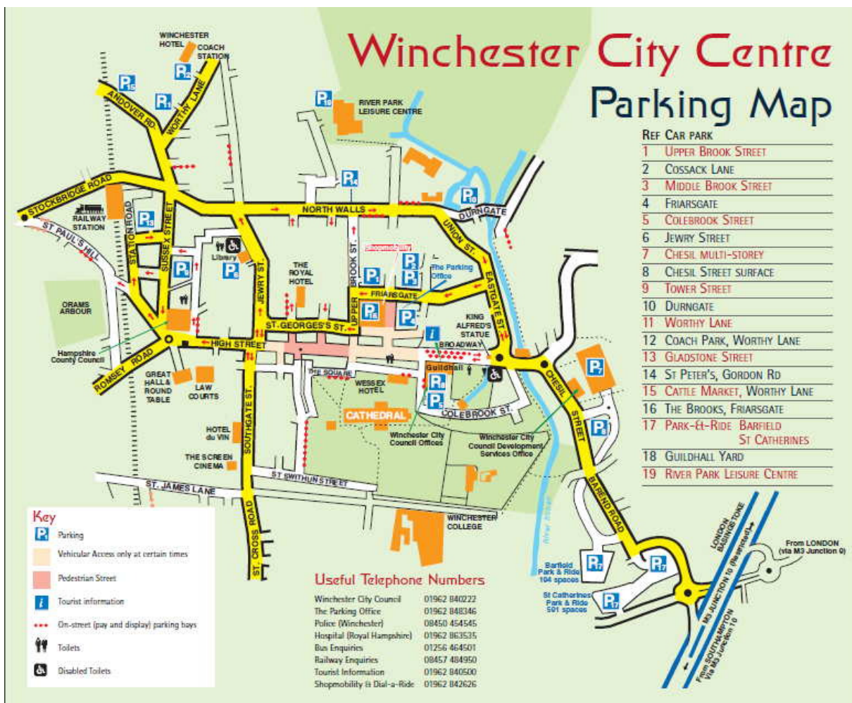
Map of Winchester