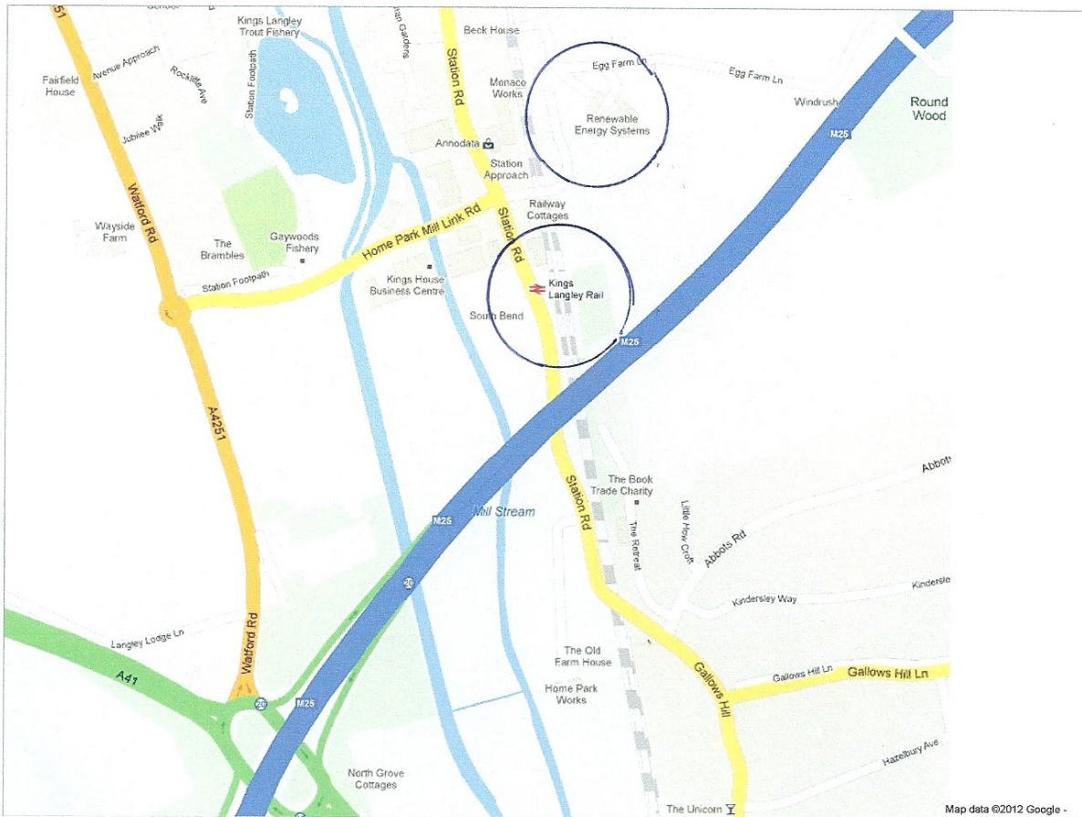
Map 1. Kings Langley Station and R.E.S.